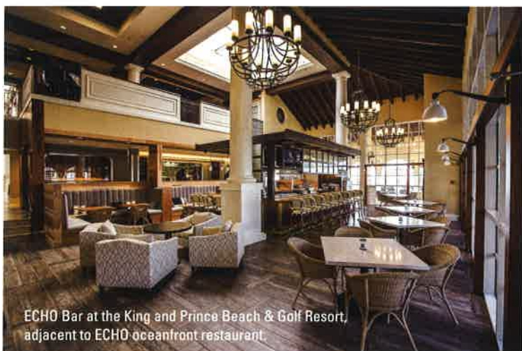
ECHO Bar at the King and Prince Beach & Golf Resort, adjacent to ECHO oceanfront restaurant.

Working with top architectural and design firms, a brilliant reimagining of the Resort took shape that would embrace the property's historic char-