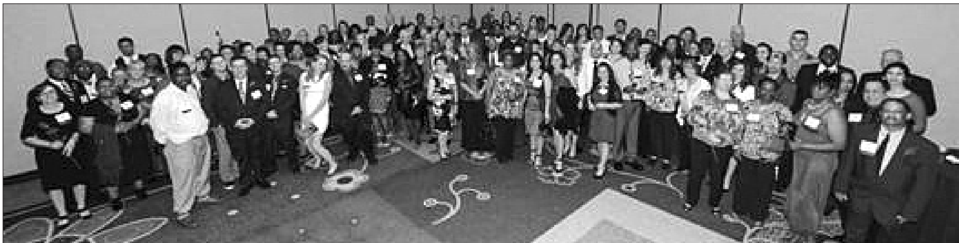
2015 nominees in 24 hospitality categories.