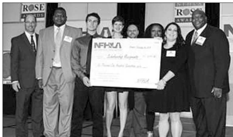
2015 Scholarship Presentation for $6117