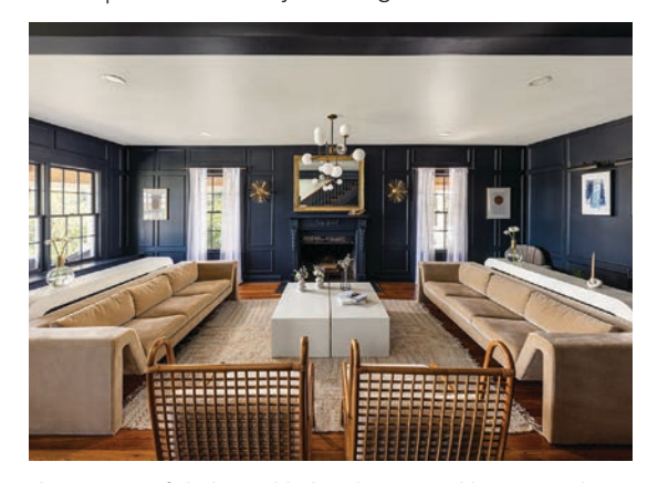
The artistry of darks and lights, luxury and history in the living room.