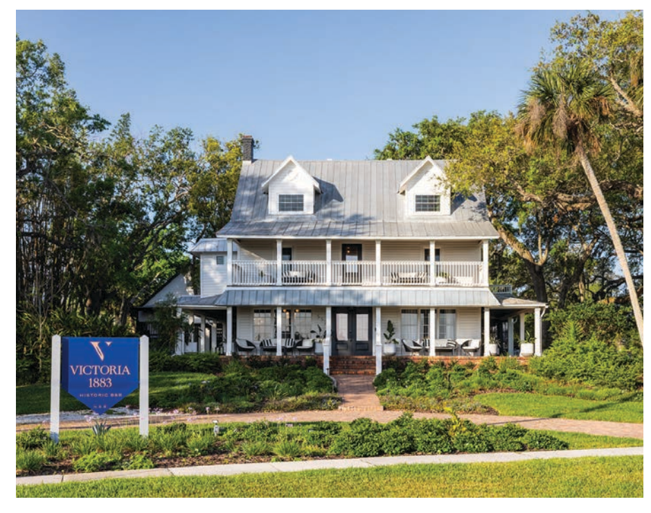
Victoria 1883 in New Smyrna Beach, one of Florida's grand homes, is now an inn.