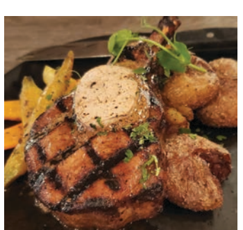
36-hour black tea-brined pork chop from Riverpark Terrace.

Whether selecting the most unbelievable English pea soup, tuna tataki or mozzarella fritta, you must order wisely since the menu will tempt you long after you've dined; you'll be counting the days until you return