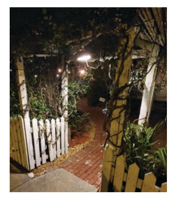
The entrance to the Garden Dining at Riverpark Terrace

Breakfast is another special moment at the Victoria 1883. The casual dining room welcomes you with beautiful music and one of Fabiola's culinary surprises, accompanied by fresh fruit, baked sweets and heavenly coffee. Nothing is left to chance. It's an elegant beginning to your day either chatting with other guests or taking breakfast in the garden. If you're staying on the second or third floors, you will love the private elevator that makes each day easy to navigate with your luggage or just to enjoy this fun way to not climb the grand staircase — whether visiting for an overnight or arriving with an entire wedding party of gowns, ensembles, tuxedos, slippers, hair stylists, makeup artists and boxes of accoutrement! The elevator is fabulous!