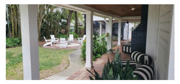
The firepit surrounded by towering bamboo.